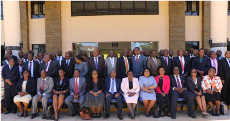
The PSC Chairperson, Commissioners, Ag CEO pose for a photo with Heads of HR in MDAs