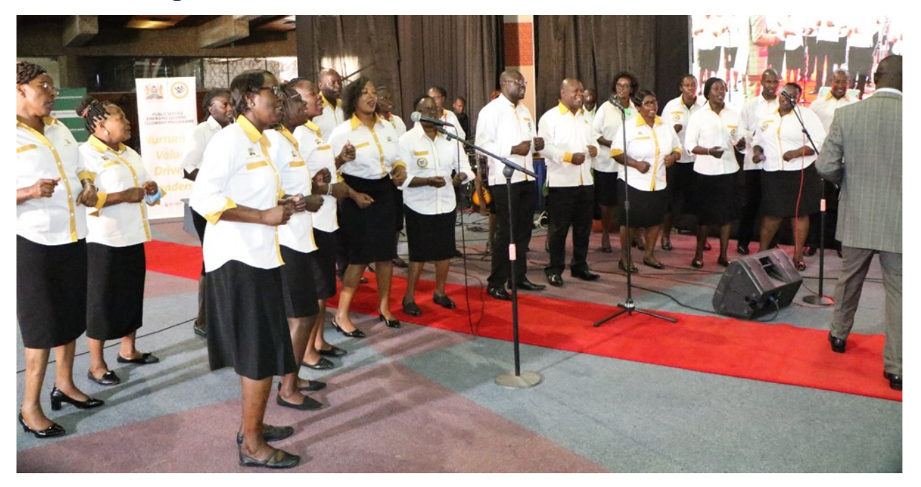
The PSC corporate choir performs at a past event