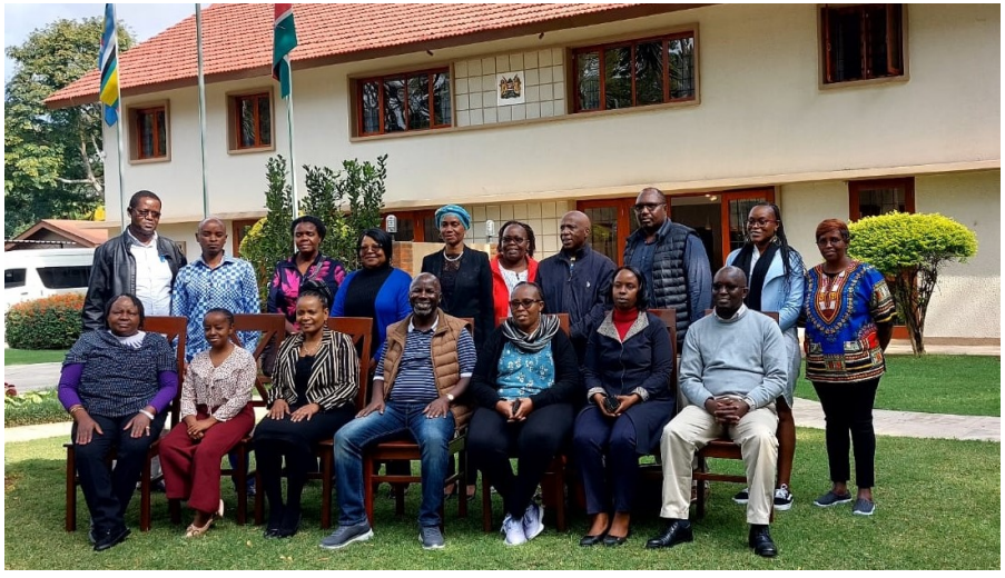
Group photo with consulate staff outside the consulate during the courtesy call