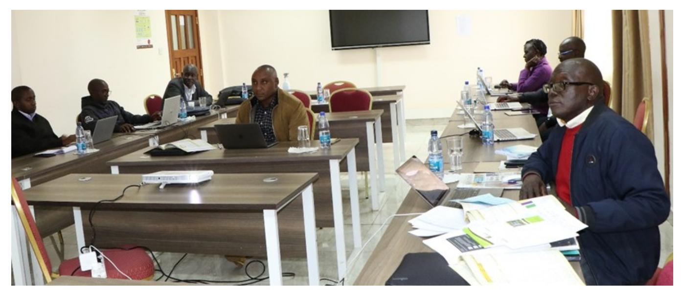
PSC inter-departmental committee charged with the preparation of the 2021/2022 report on the status of public service compliance with Values and Principles during a retreat at Kenya School of Government, Nairobi.