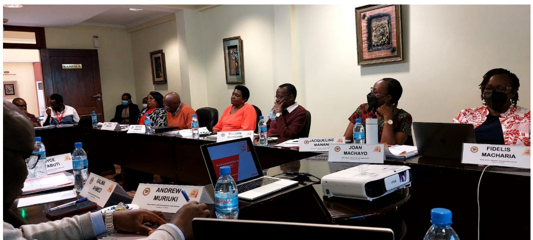
PSC Chairperson, Commissioners, CEO and a section of senior staff during a training session