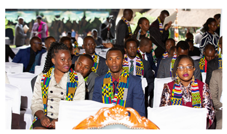
Graduands following proceedings