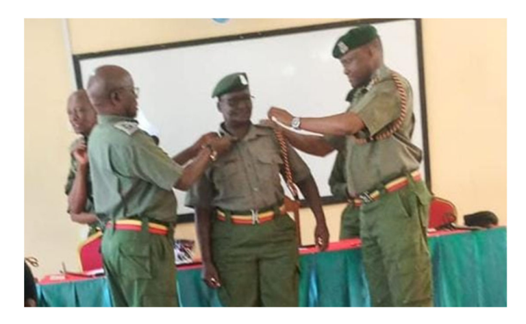
One of the Prisons officers that were promoted by the Commission

The promotions are in line with the commission mandate which is a requirement Under Article 234 of the 2010 constitution in which it is required to develop human resource in the public service through recruitment and promotion of competent officers.